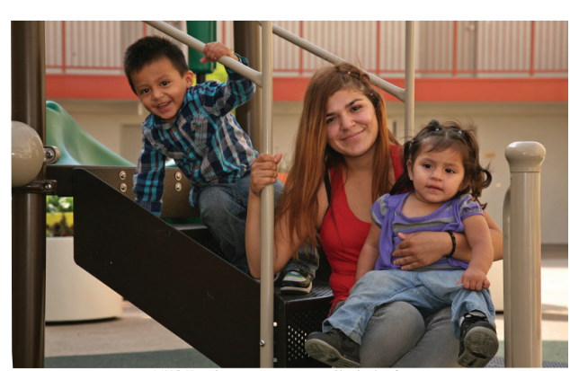
ON THE COVER: Clockwise from upper left, Cathedral Gardens, EAH Housing; Huntington Plaza, USA Properties Fund; Estrella Del Mercado, San Diego Housing Commission; Perris Station, Highridge Costa Housing Partners