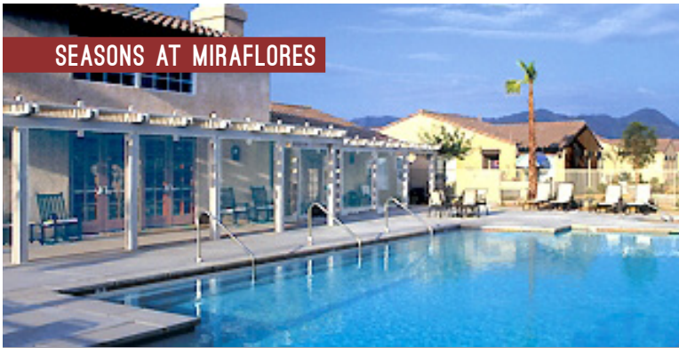
SEASONS AT MIRAFLORES

in ANNUAL ECONOMIC ACTIVITY Boosting the local economy.