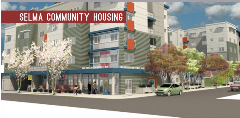
SELMA COMMUNITY HOUSING

in ANNUAL ECONOMIC ACTIVITY Boosting the local economy.