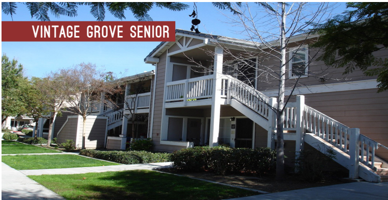
VINTAGE GROVE SENIOR

$66 MILLION in ANNUAL ECONOMIC ACTIVITY Boosting the local economy.