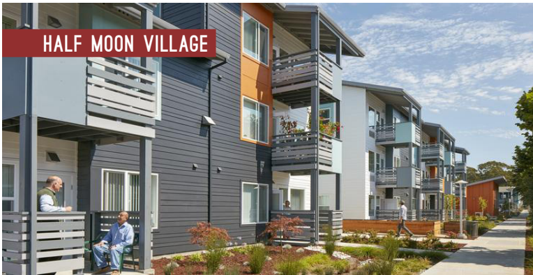
HALF MOON VILLAGE

in ANNUAL ECONOMIC ACTIVITY Boosting the local economy.