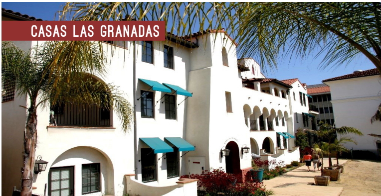
CASAS LAS GRANADAS

in ANNUAL ECONOMIC ACTIVITY Boosting the local economy.