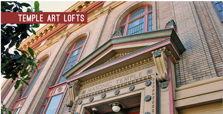
TEMPLE ART LOFTS

Temple Art Lofts stand out as a model for affordable development that transforms lives. The historic preservation and adaptive reuse of the 1917 Masonic Temple and adjacent 1872 City Hall building transformed two dilapidated and foreclosed upon buildings into 29 affordable live/work lofts for artists. The project features artist studio space and a fully renovated performance hall. Ground floor retail space will include a café and office space for nonprofit arts organizations.