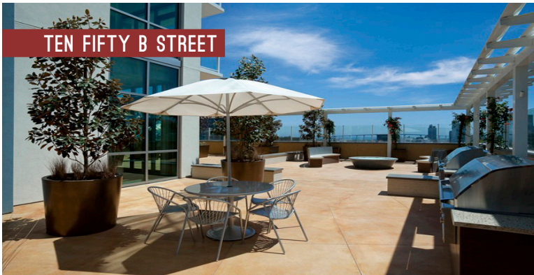
TEN FIFTY B STREET

in ANNUAL ECONOMIC ACTIVITY Boosting the local economy.